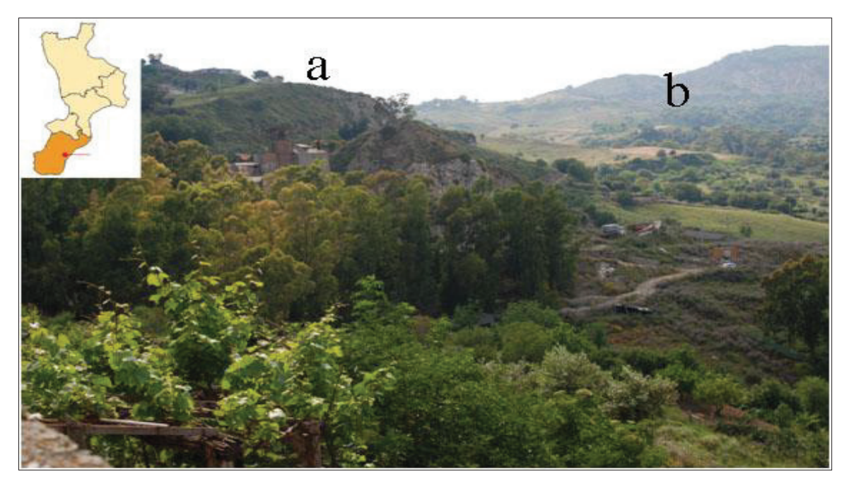
Fig 1- Benestare open-pits location in Timpa (a) site and Pignataro site (b)

Gypsum deposits and depositional environment in Benestare